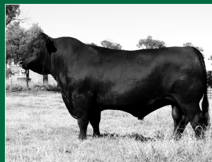
Sire of Raff Hercules H411 - Raff Empire

He is a direct son of Raff Empire E269 whose dam resulted from the importation of frozen embryos out of leading donor Hoff Blackbird 5217 after her purchase in 2006 at the famous Hoff Scotch Cap Angus Dispersion Sale. A full sister to Hercules sold in 2012 for $17,000 when just eight months of age. Hercules has spent the past period at Total Livestock Genetics where he has been in collection to allow for the